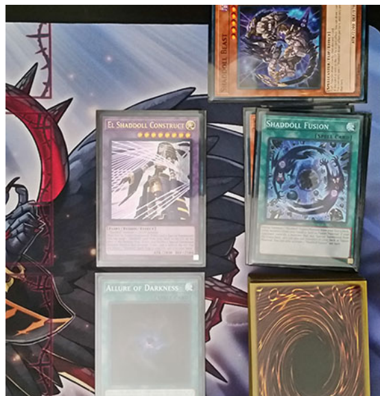
Use the empty space above the Graveyard for banished cards