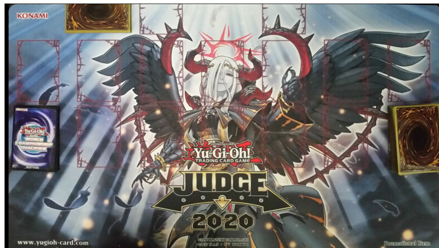
Example of a good play area setup with all zones visible